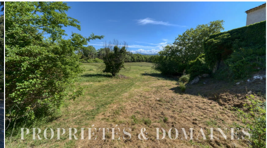
PROPRIÉTÉS & DOMAINES