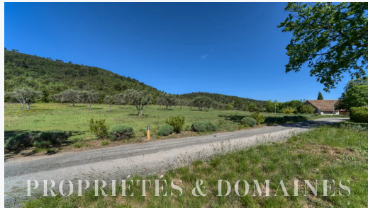
PROPRIÉTÉS & DOMAINES