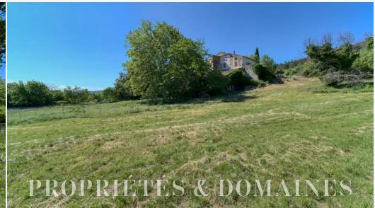
PROPRIÉTÉS & DOMAINES