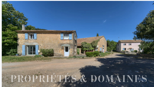
PROPRIÉTÉS & DOMAINES