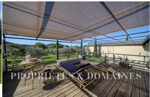
PROPRIÉTÉS & DOMAINES