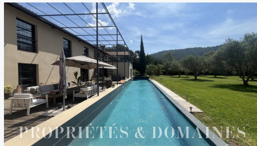
PROPRIÉTÉS & DOMAINES