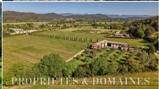
PROPRIÉTÉS & DOMAINES