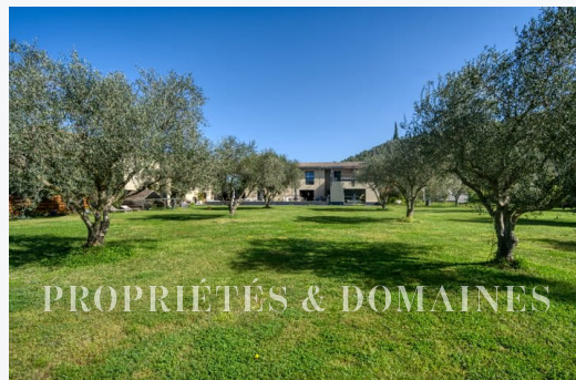
PROPRIÉTÉS & DOMAINES